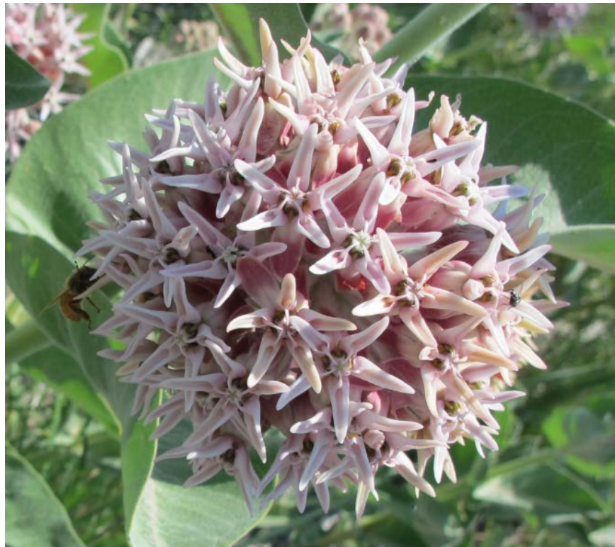
Figure 1. An umbel of showy milkweed flowers in full bloom.

Milkweed flowers bloom in umbels (Figure 1), which are clusters of individual flowers on stems that emerge from a common point (Young-Mathews and Eldredge, 2012).