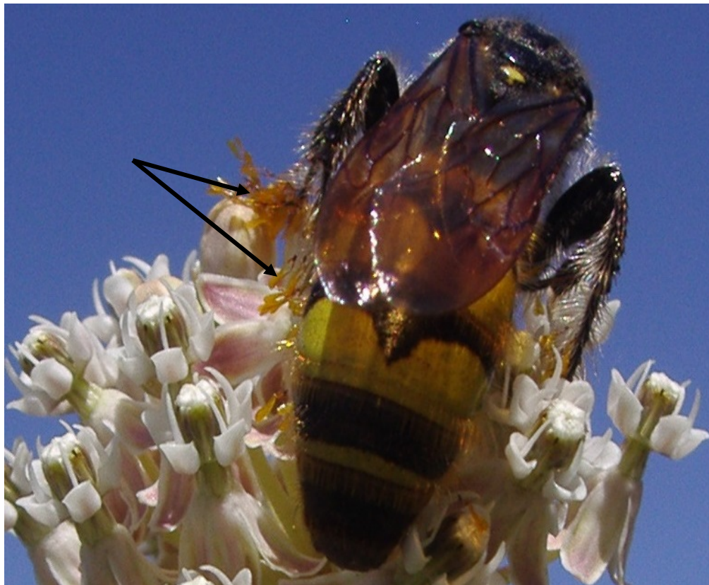
Figure 5. An unidentified large wasp nectaring on narrow leaf milkweed, bearing many pollinaria attached to the hairs on its legs (at arrows).