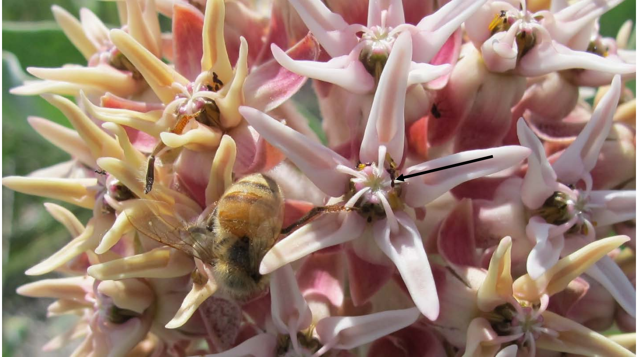
Figure 7. The headless carcass of a trapped honeybee, one leg lost and still not free. A catena of corpacula is visible to the right of her trapped tarsus (at arrow).

After insertion of a pollinium into a stigmatic slit, if the insect is strong enough to break the translator arm and escape, the broken stub is the perfect size, shape, and orientation to catch another corpusculum. This may repeat until chains (catena) of corpuscula are formed, in a process called concatenation (Peter and Shuttleworth, 2014).