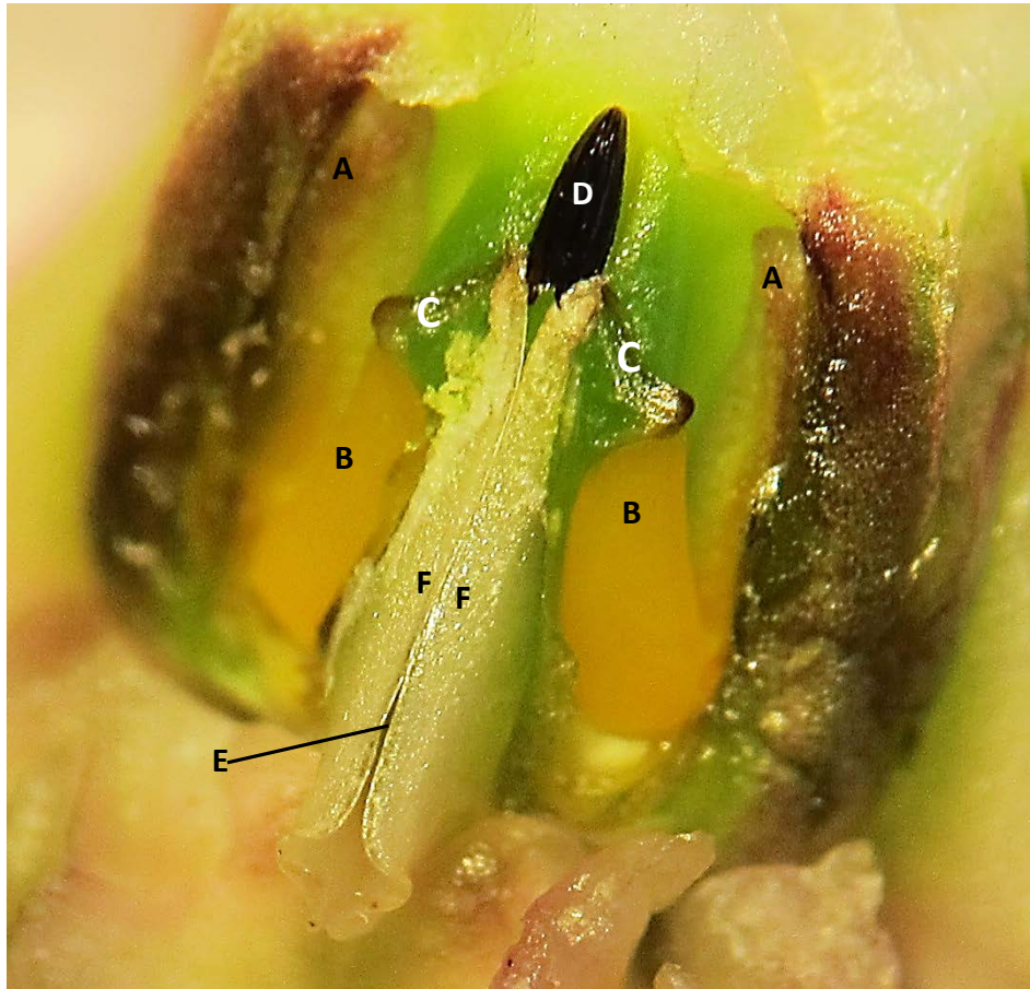
Figure 3. A magnified view of a dissected showy milkweed flower, with the anther pouch walls (AA) removed to show a pollinarium and the position of the pollinia (BB), translator arms (CC), and the corpusculum (D) at the top of the stigmatic slit (E) formed by the guide rails (FF).

Insects that visit a flower to drink nectar struggle to grasp the slippery surfaces and may accidentally slip their leg, tarsus, mouthpart, or other appendage into the opening at the bottom of the stigmatic slit. This slit is formed by guide rails, which are lined with bristles that prevent the insect moving its appendage any direction but up. The top of the slit leads into the opening of the corpusculum, which has hard, sharp inside edges that taper together at the top. The corpusculum clamps firmly to the insect by pinching onto the insect's appendage. In its struggles to escape, if the insect is large enough, it can withdraw the paired pollinia from the anther pouches and fly away (Figure 5).