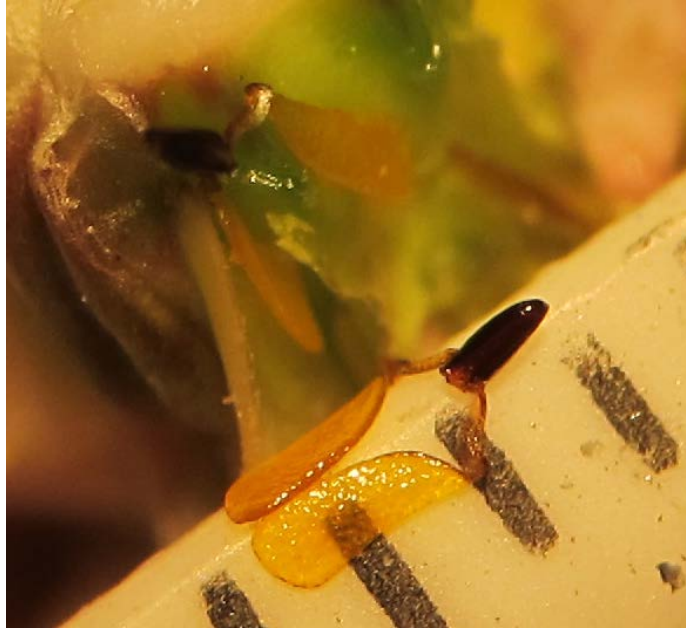
Figure 4. A pollinarium of showy milkweed on the edge of a millimeter scale, and an exposed pollinarium in the background.