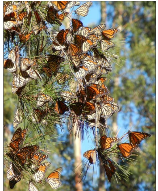
A tree full of orange butterflies was once a common sight in California's monarch groves. This winter, the numbers of monarchs hit an all-time low, with just 28,429 butterflies counted.

Western monarchs need everyone's help. Once, millions of monarchs overwintered along the Pacific coast in California and Baja, Mexico. In the 1980s, it is estimated, at least 4.5 million butterflies migrated to the coast annually. But by the mid-2010s the population had declined by ca. 97% (Schultz et al. 2017). In 2018, monarch