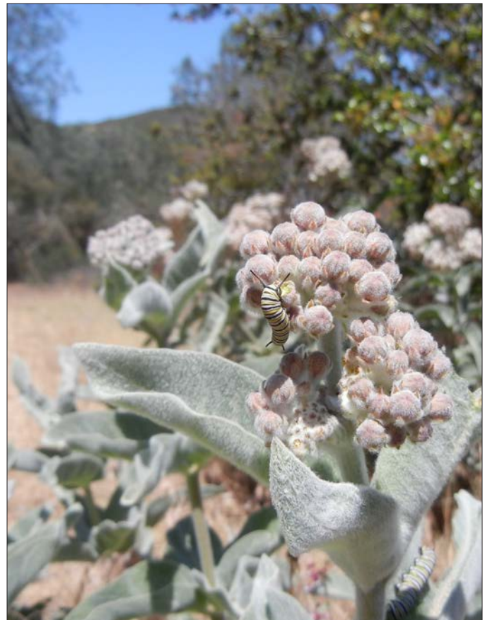
Planting native flowers and native milkweeds will support monarchs leaving the overwintering sites and searching for places to lay eggs. This woollypod milkweed ( Asclepias eriocarpa ) growing in southern California provides food for hungry monarch caterpillars.

We need to work towards increasing native milkweed and nectar plant availability for both seeds