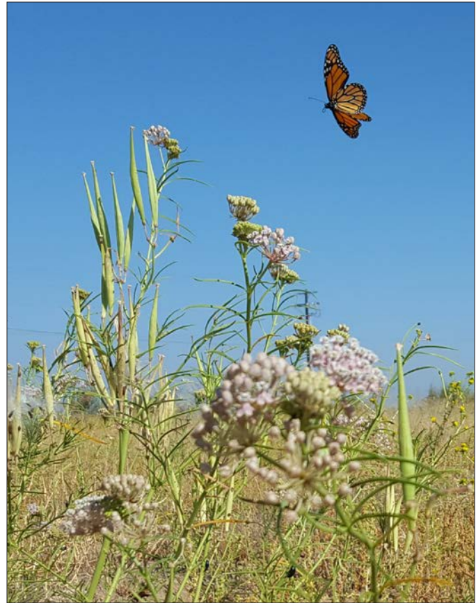
The monarch is a renowned traveler. During the summer, butterflies spread out from California and across the western states. Habitat to support their breeding and migration is necessary to sustain population growth and ensure their return.