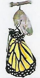
Expanding Wings Day 31 4hrs. 5min.