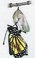
Expanding Wings Day 31 4hrs. 3min.