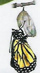
Expanding Wings Day 31 4hrs. 4min.