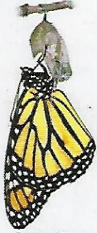
Drying Wings Day 31 4hrs. 6min.