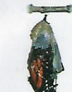
Emergence Day 31 4hrs. 34sec.